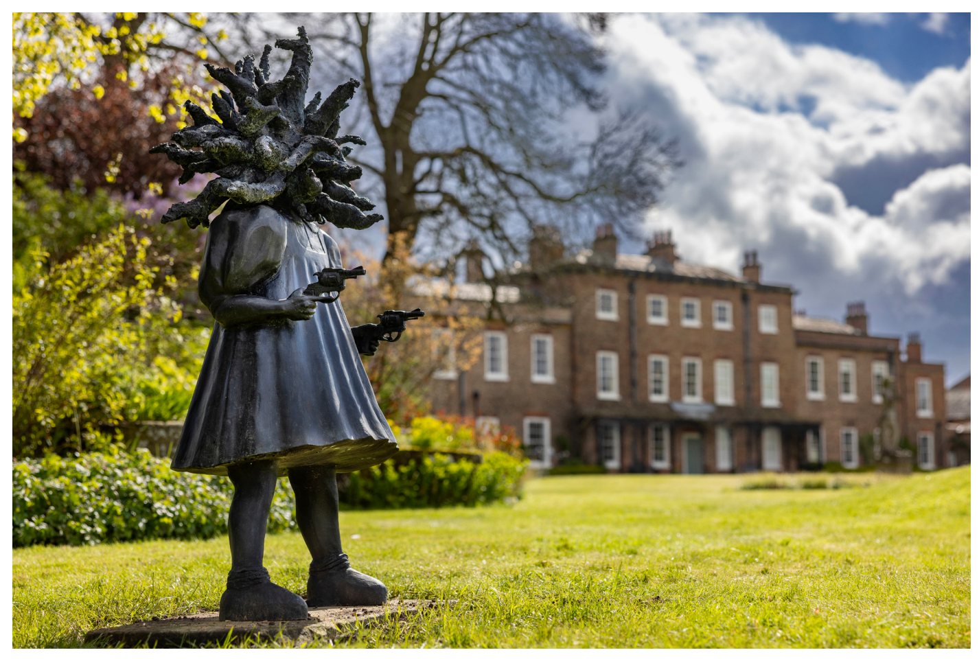
Laura Ford, Twiglet 1991, Bronze, 51 1/8 \times 23 5/8 \times 22 1/2 in, 130 \times 60 \times 57 cm, Edition 1 of 5 plus 2 APs