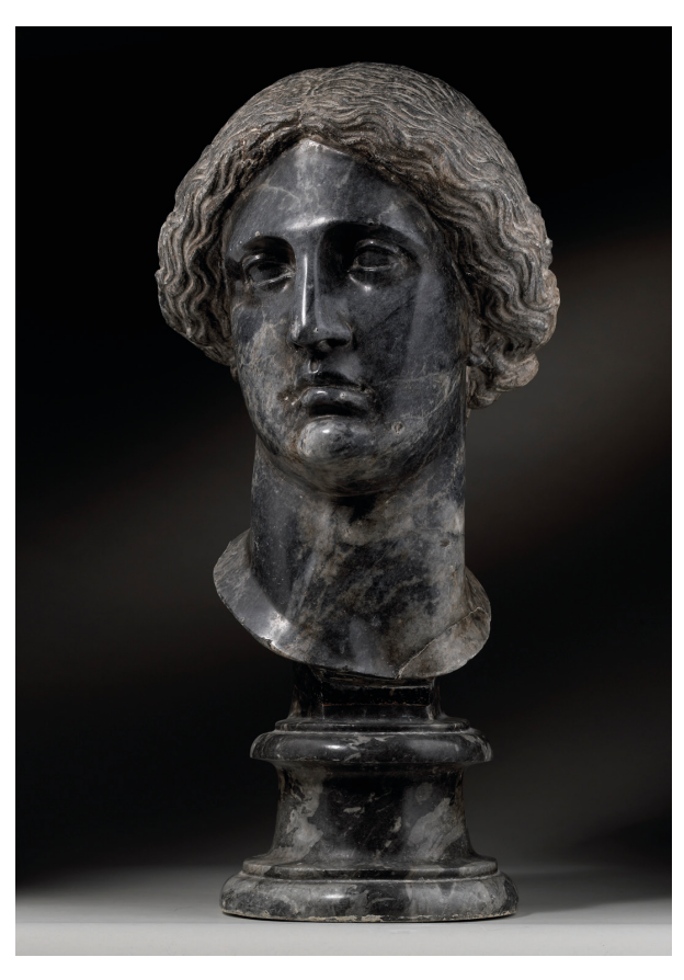
Roman, Head of an Amazon, After the Antique, 17th century, Bigio Morato

Since then, over those millions of years, humankind's cultures and our relationship with the planet can be most clearly seen through the enduring material of stone. Any organic traces of manufactured objects soon disappear as they degrade back into nature. Both in terms of objects and later, architecture, we can achieve some understanding of ancient cultures, or, at the very least, some connection. The stories that have survived from more recent stone remains are not so different from our more thoughtful contemporary preoccupations: our survival, and our origins – and the desire to understand the source of the power/s that the universe we see around us.