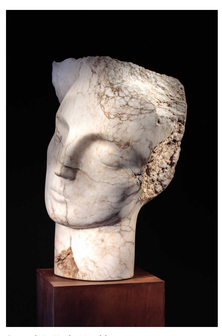
Contemplative Head, 2018, Alabaster

In the early 1980s she started carving in stone, preferring to use discarded materials from abandoned quarries. The primary objective of her sculpture turns out to be to bring humankind and the living planet into a consciously closer conjunction. Our relationship has been clouded over time by millennia of fantasies about the nature of power and human privilege over nature.